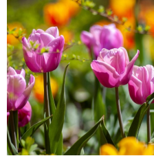
Spring Garden Resources