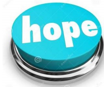
Positive Climate News