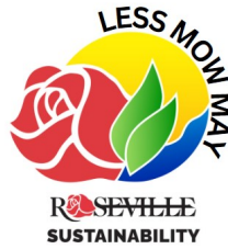
Less Mow May