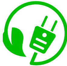
Sustainability Tip of the Month