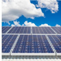
Grow Solar Webinar & Group Purchase