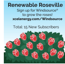
Renewable Roseville Challenge