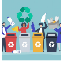
Clean Up Day