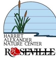
Earth Day Celebration